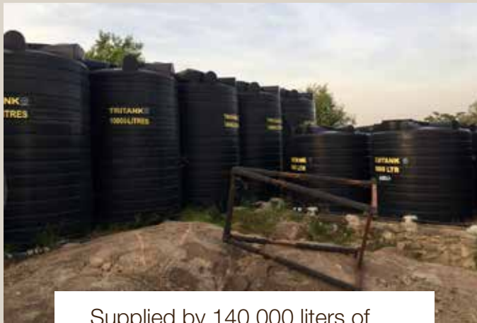
Supplied by 140 000 liters of water, twice filtered