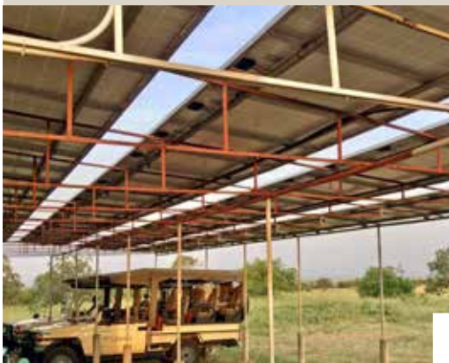
188 solar panels, some double up as covered parking

It takes 1.4 tons of coal to produce 1 Mwh. Lemala Tented camps operate 100% off grid.