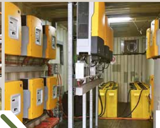
Supply energy to inverters