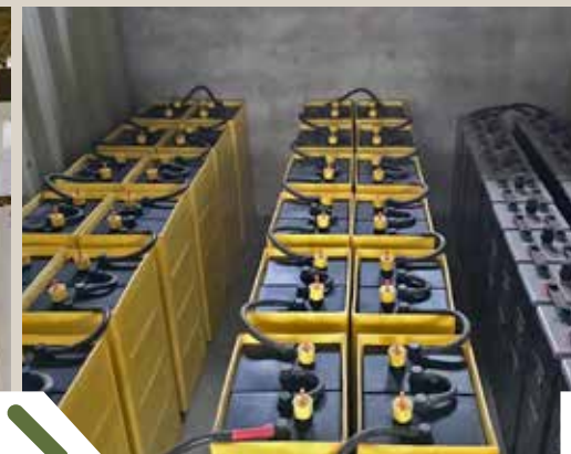
That energy is converted into energy stored in battery banks