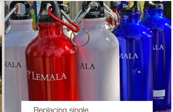
Replacing single use plastic bottles!