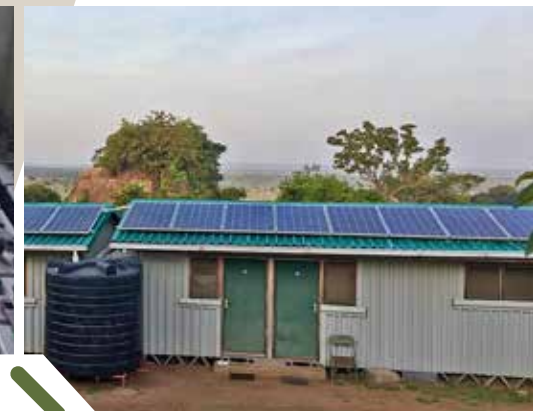
And all systems controlled remotely from an off site office