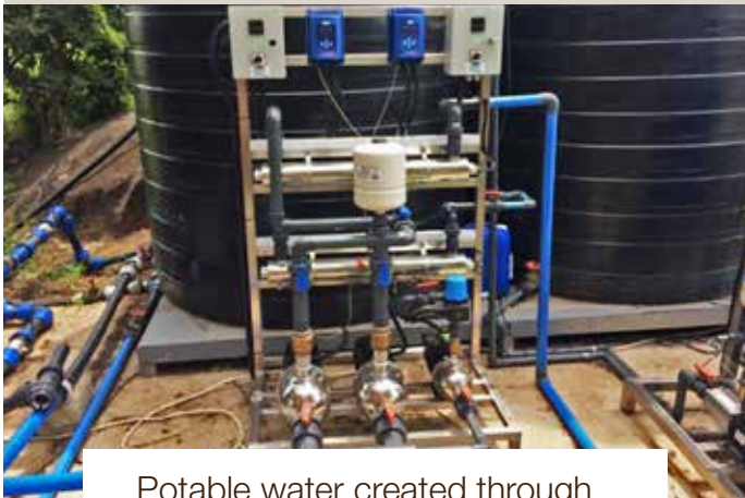
Potable water created through a reverse osmosis plant

We have now included state of the art pumps that communicate wirelessly to ensure that the water pressure remains constant. Every drop of water that comes out the taps has been filtered and passed through a UV light to kill bacteria. In the new system we also constantly circulate the water in the holding tanks to ensure it does not stagnate and in this circulation we pass the water through a UV light.